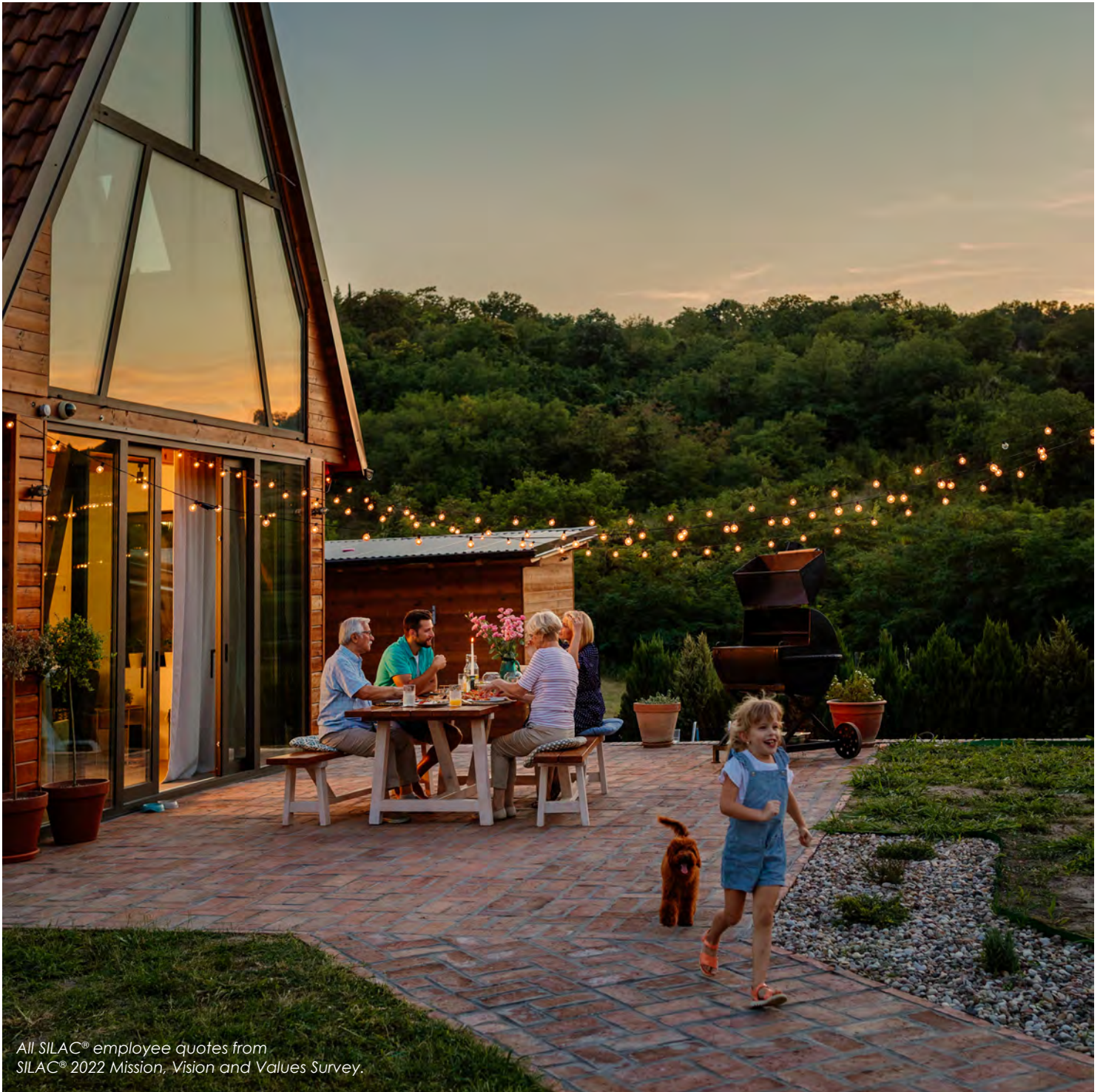
All SILAC® employee quotes from SILAC® 2022 Mission, Vision and Values Survey.